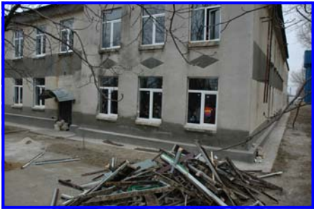
All 391 windows now replaced with new double glazing. These children now have warmth instead of the bitter cold.

When we visited the largest orphanage in Moldova we found 650 children hanging by a thread against winter's icy blast. Invited there by the minister of education, we were appalled to see broken and cracked windows with frames that had rotted to dust over sixty years.