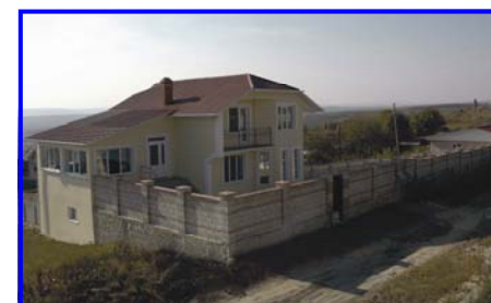
Stella's House 1: A place of refuge and new hope.

For the last three years, The New Hope Trust has been quietly working against this tidal wave of evil. We have built two homes where these young ladies are rescued before being trafficked—they have found a place of refuge and a new hope.