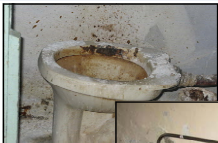
Dirty toilets, mould and damp make for horrendous conditions in which these children live.

These children who are growing up in a world of abject poverty in a communist regime that turns them onto the streets when they turn sixteen; with no prospects or hope and the very real danger of being trafficked in the sex trade.