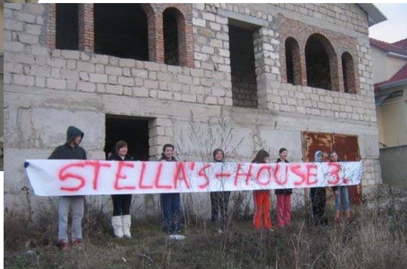
Right: Some of the girls from Stella's House II spray painted the reverse of some wallpaper as they celebrated the purchase of the building that will become Stella's House III. These girls know firsthand, the lifeline this house will offer other orphan girls in danger of being trafficked.

The shell of what is to become Stella's House III has been purchased and is sitting ready for the next stage of development. It will cost approximately £170,000 to finish the house ready for furnishing.