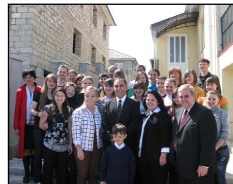
The girls of the Stella's Houses pictured with the US Ambassador and his wife at the opening of Stella's House II.