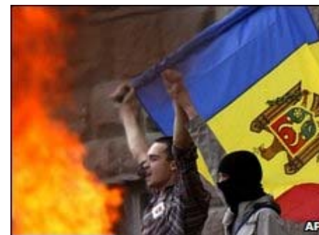
Rioters burned the Parliament building as they protested over the re-election of the communist government. (BBC World Service, April 2009)

The borders were closed and had been placed on high alert. Was the risk too great to continue? What should we do?